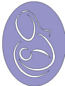
Mother Child laser Inlay