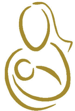
Small inlay pieces